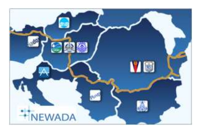
NEWADA project partners

After the NEWADA project the follow-up project (NEWADA Duo) continued the development of the portal. A new mobile version of the Danube FIS Portal is planned in the frame of the Danube STREAM project.