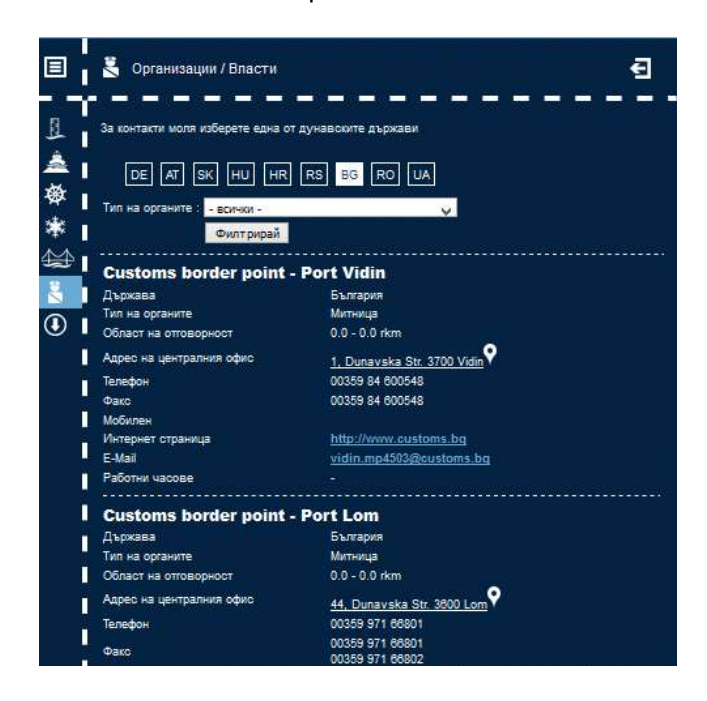
Authority information in Bulgarian language

In the waterway objects section basic static information on bridges and locks (size, contact) are provided. Location and contact information on ports are also available.